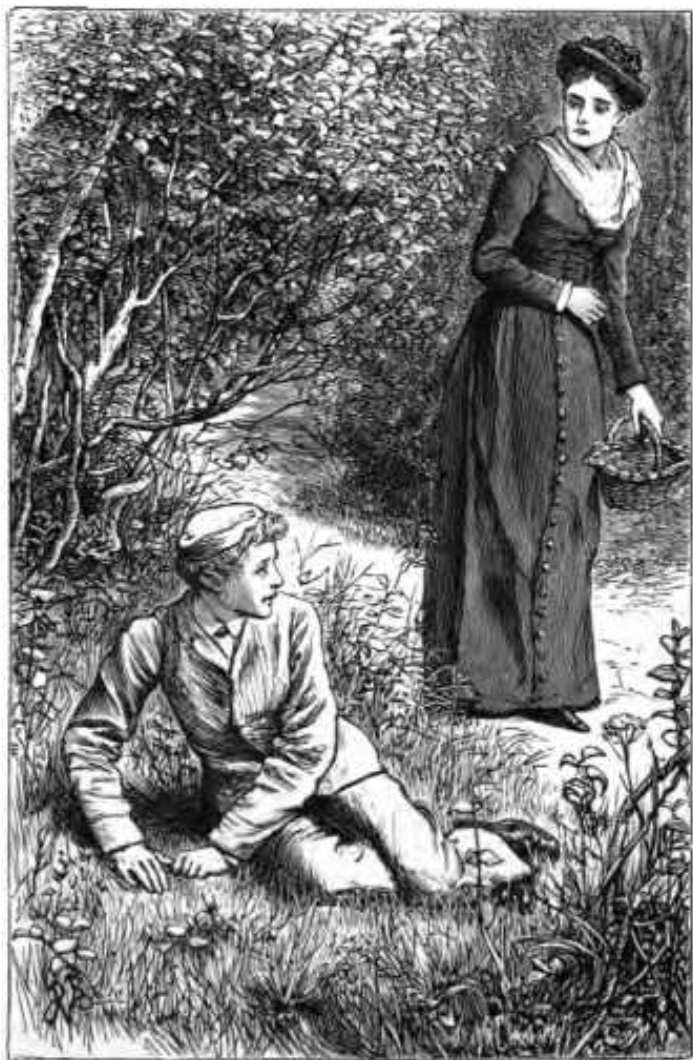
THE MEETING IN THE WOODS. Page 76.