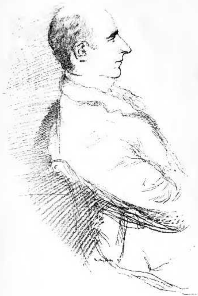
Arthur W. Pinero. From a drawing by Rothenstein.