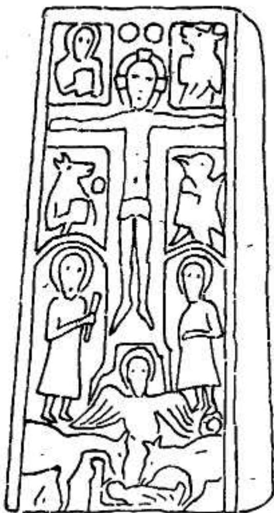
NATIVITY AND CRUCIFIXION ON SAXON CROSS, SANDBACH, CHESHIRE.