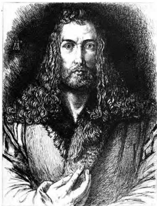
ALBRECHT DÜRER. FROM THE PAINTING BY HIMSELF In the Pinakothek, Munich.