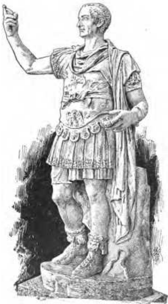
C. JULIUS CAESAR.