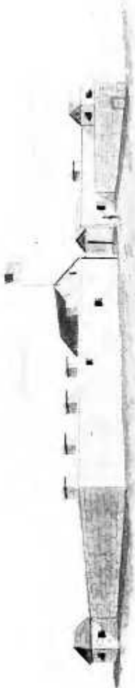
SKETCH OF FORT, 1847. — Page 7.