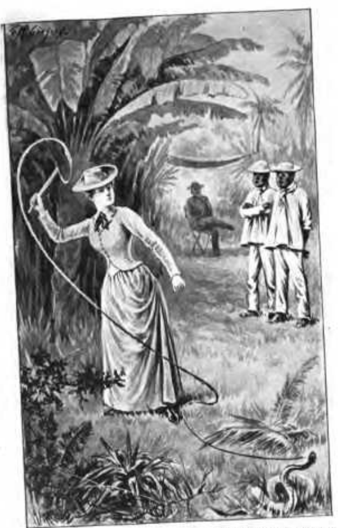
"the stark writher a consumed series of foils thus the ground." -Page 39.