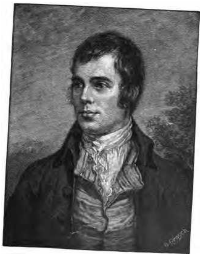
ROBERT BURNS (After a painting by NASMYTH)