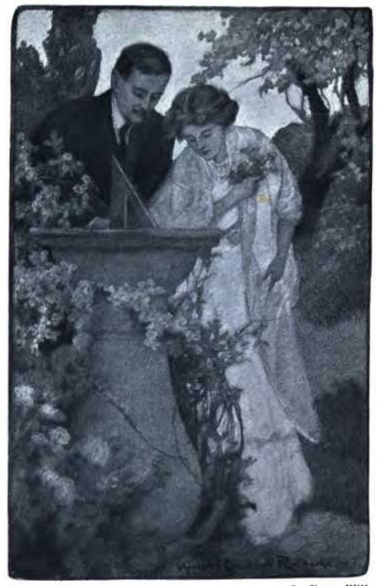
See Chapter XXII