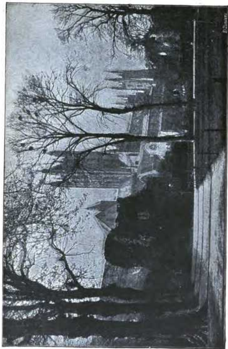
CANTERBURY CATHEDRAL FROM THE NORTH