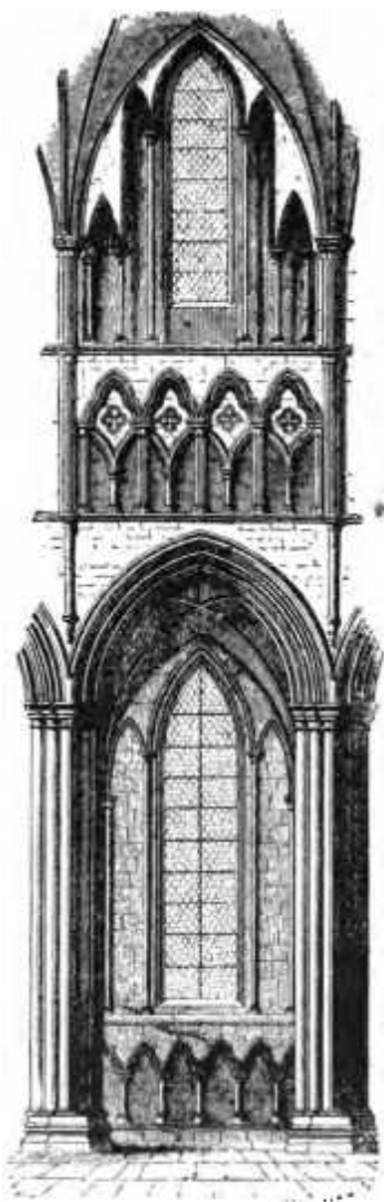
EARLY ENGLISH BAY, BEVERLEY MINSTER.

The Early English style is much lighter and more graceful: the arches are pointed, the windows are lancet-shaped at their heads, and are often grouped together in pairs or triplets or sets of larger numbers. No better typical example can be found anywhere than the cathedral church at Salisbury, which, owing to the site of the earlier church having been abandoned in the early part of the thirteenth century, and the existing church erected on a new site, contains nothing of