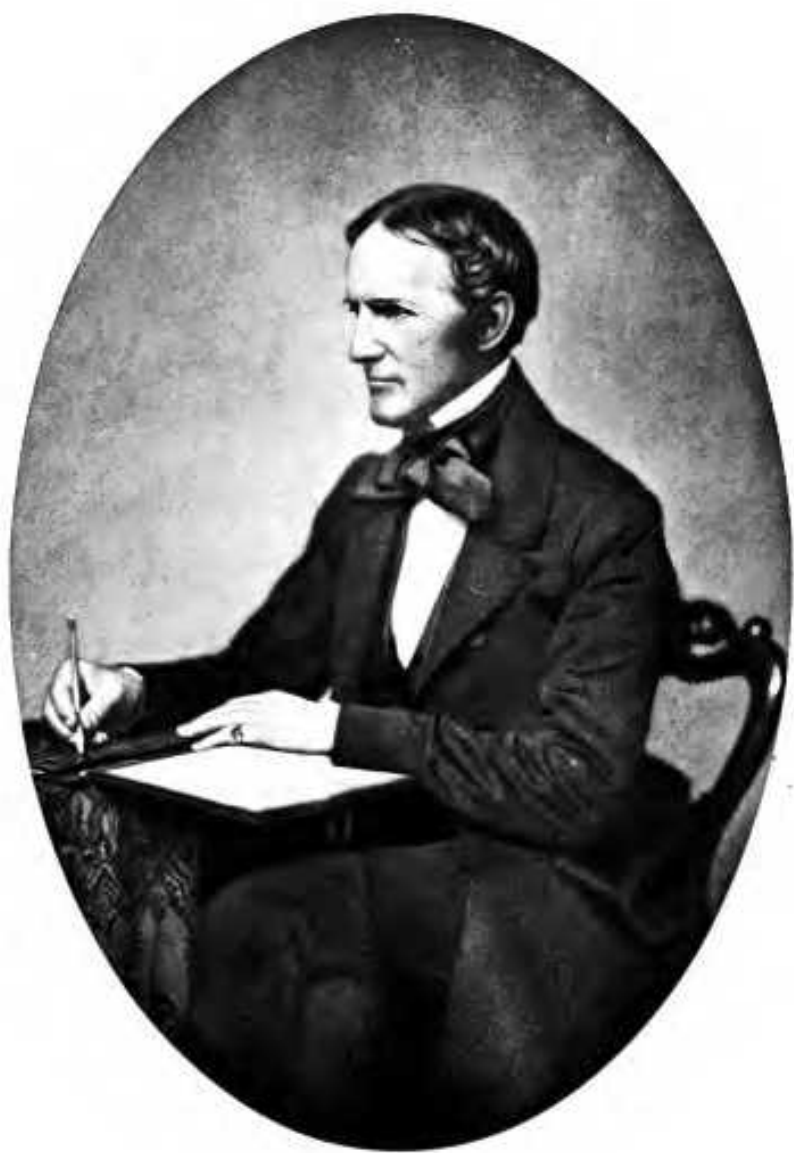
Wm. H. Prescott