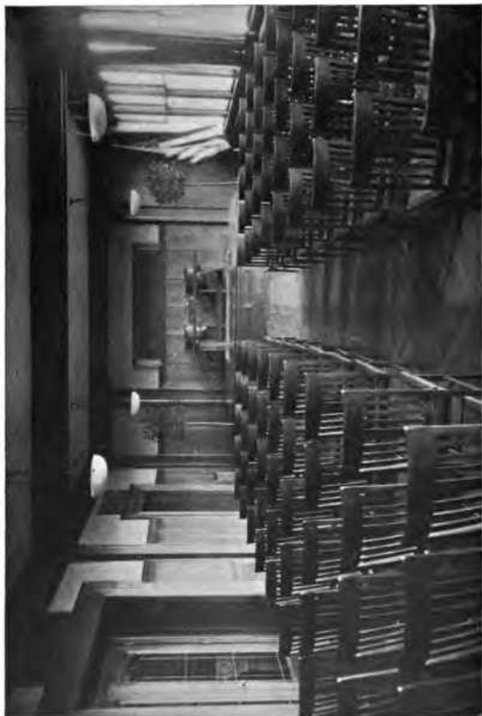
HUBBARD HALL—THE CHAPEL