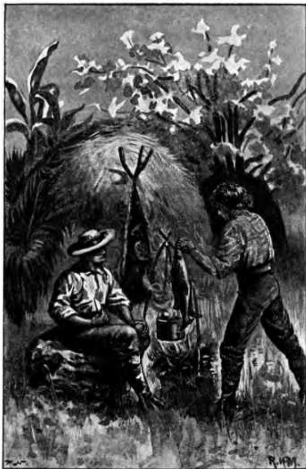
HERE A WEEK WAS SPENT VERY PLEASANTLY (page 185). Frontispiece.