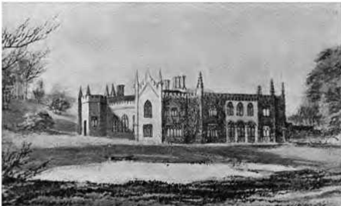
"HAYNE" CASTLE, DEVONSHIRE, ENGLAND.