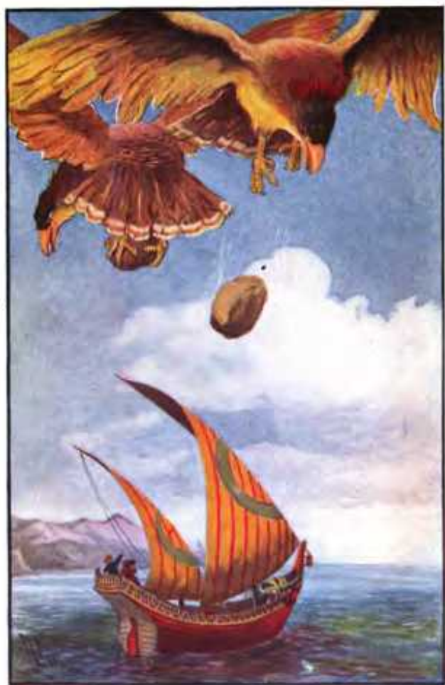
Der eine Wad ließ das Helsenstik fallen