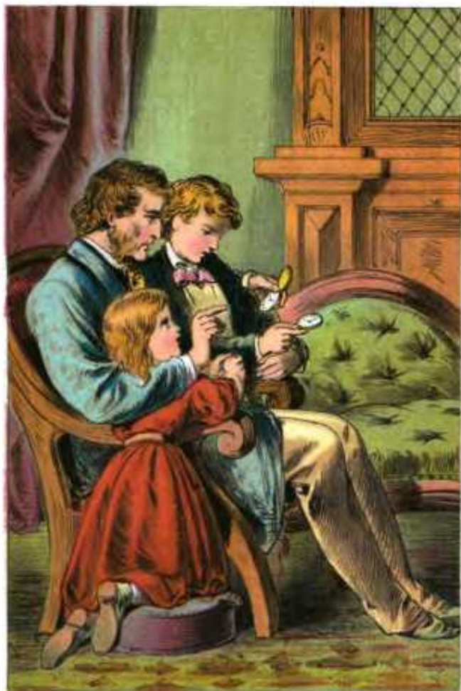
THE TWO WATCHES COMPARED page 32