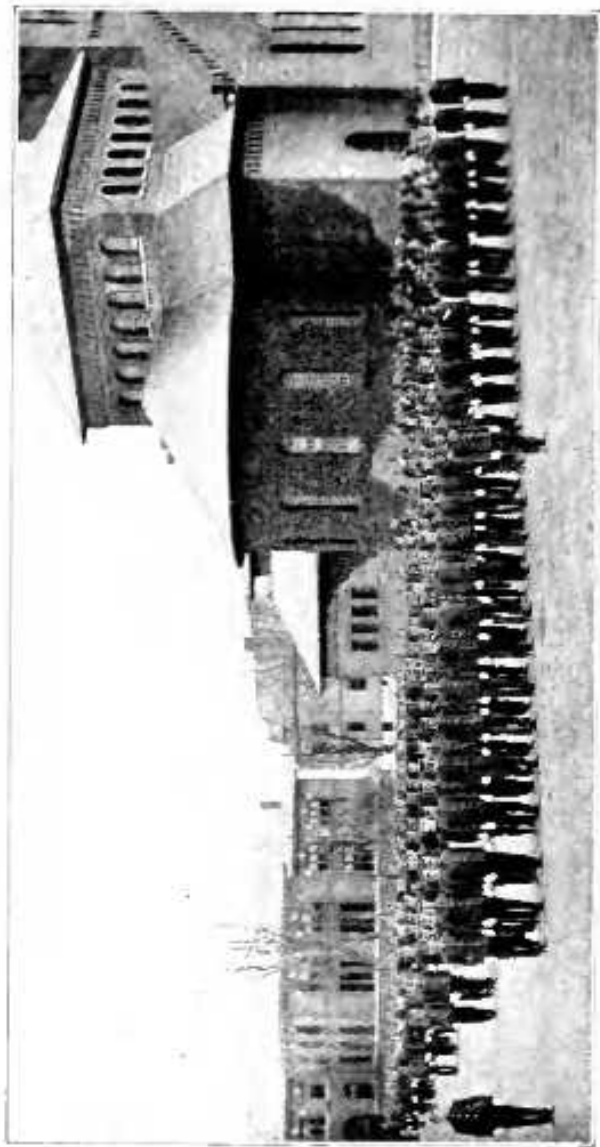
THE DANCE-HOUSE AT HAMPSHIRE INSTITUTE.