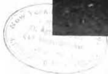
THE BELLE OF SARK