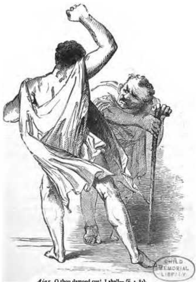
Ajax. O thou damoed cur! I shall— (ii. 1. 84).