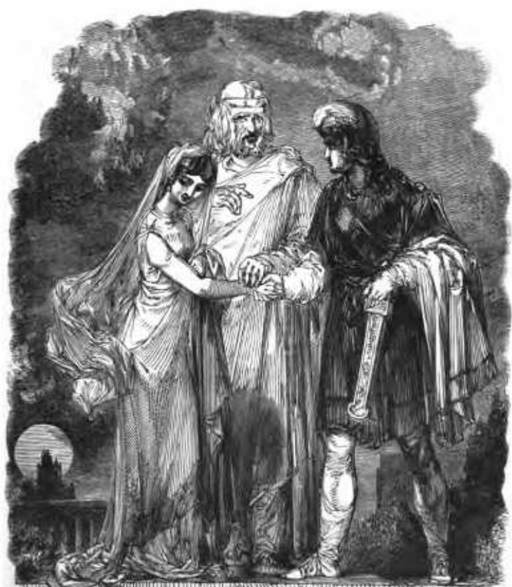
TROILUS & CRESSIDA