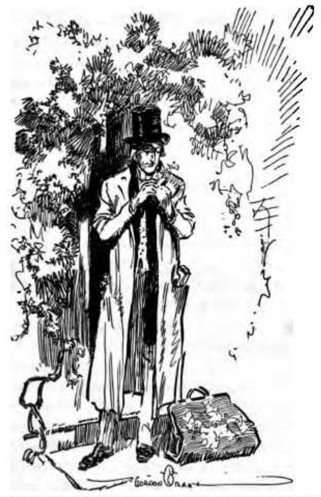
"The young man put the honeysuckle in his buttonhole"