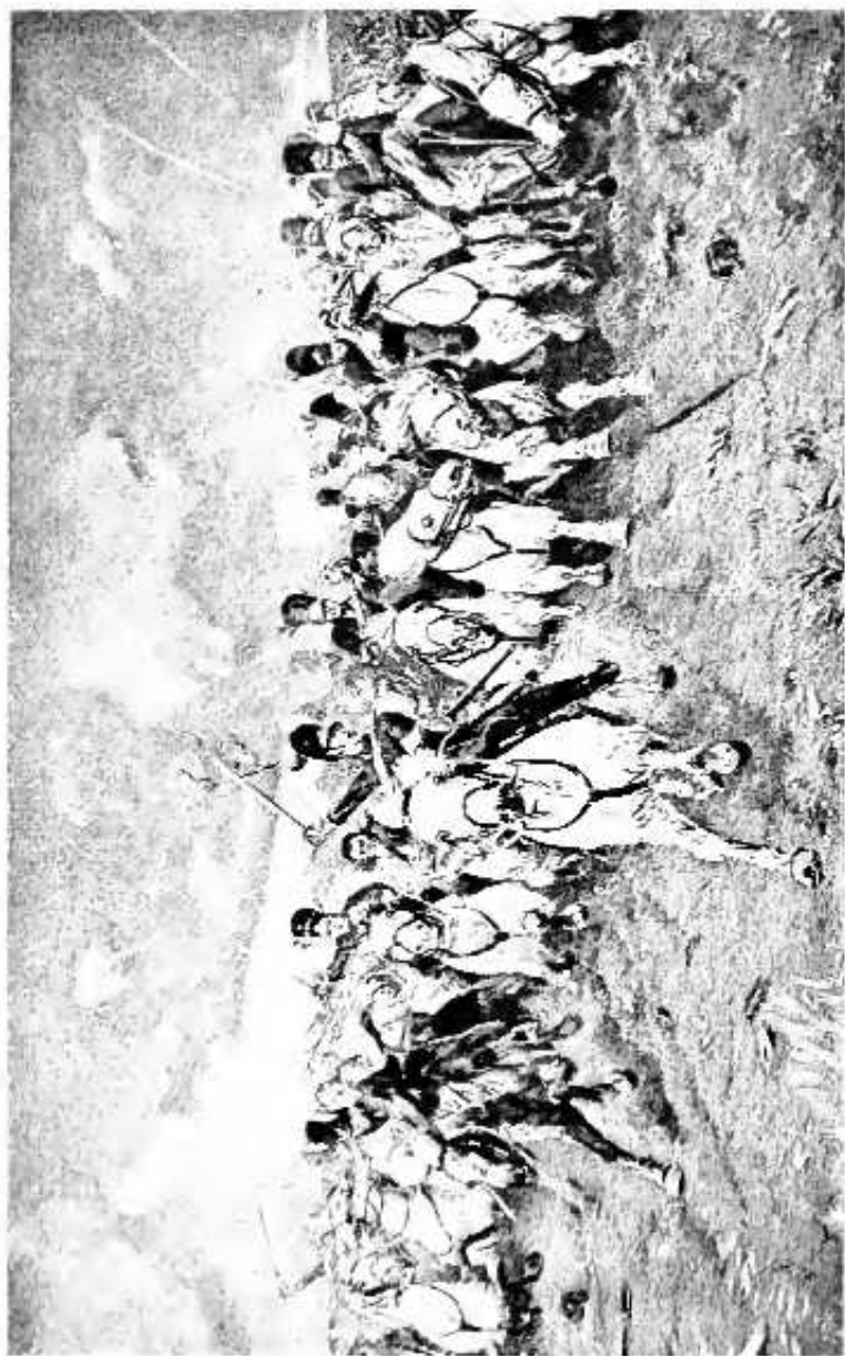
CHARGE OF THE SOUTH AFRICAN MOUNTED RIFLES