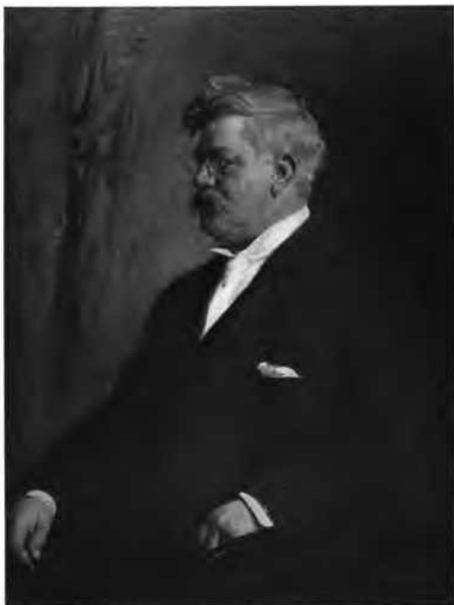
FRANK DUVENECK From the Portrait by Joseph DeCamp