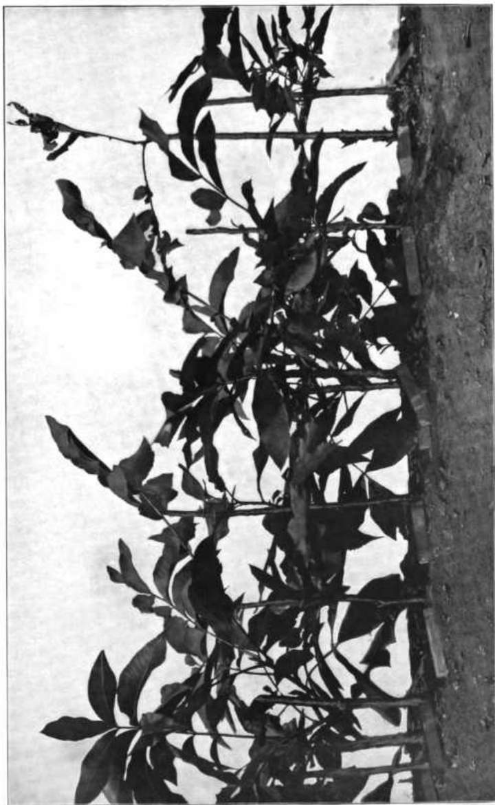
SEEDLING PECANS BUDED BY NEW METHOD.