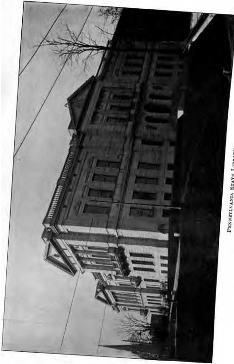
PENNSYLVANIA STATE LIBRARY.