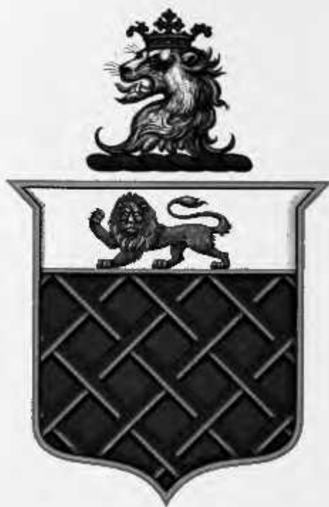
JEFFERAY COAT OF ARMS.