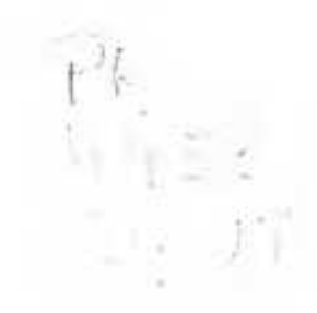
First Published in 1920