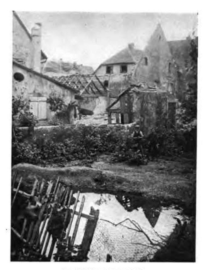
A GARDEN SHELL-HOLE

THE placid surface of this artificial lake conceals the wound torn in an Alsatian garden by a shricking German shell which fell short of its intended mark. But this section of Alsace is French once more, and the quaint, walled-in gardens will blossom on French soil, and in time the scars of Prussian shells will be obliterated by the growth of luxuriant vines.