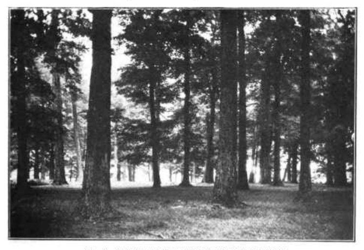
Fig. 2. SUGAR MAPLE GROVE NEAR BITTINGER 250,000 LBB. OF MAPLE SUGAR AND 3.000 CALLONS OF MAPLE BUTCH IS THE AVERAGE ANNUAL PRODUCTION IN GARRETT COUCTRY