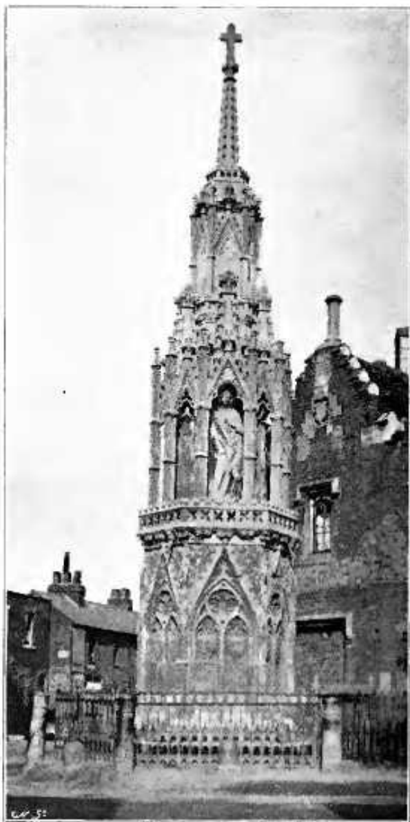
QUEEN ELEANOR MEMORIAL: WALTHAM CROSS.