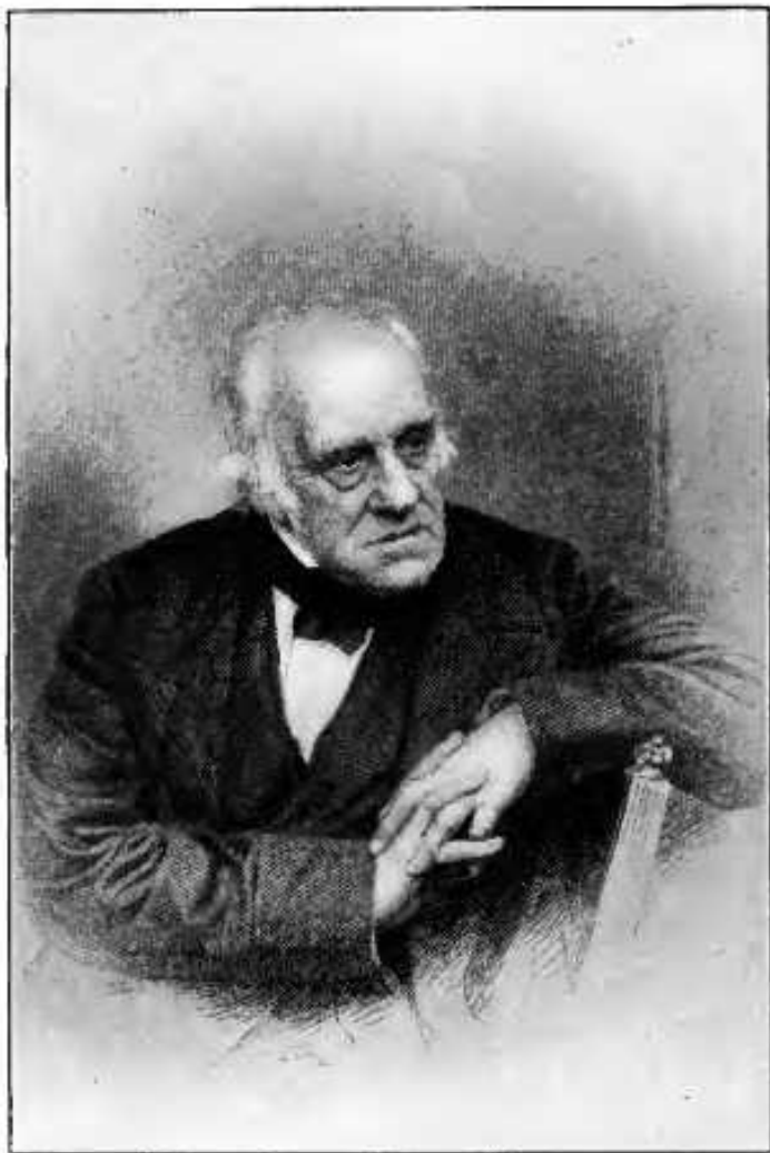
HENRY CRABB ROBINSON (ætat 86)