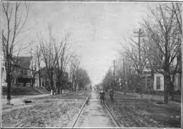
EAST WASHINGTON STREET.