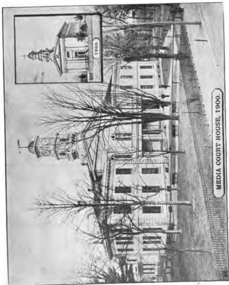
MEDIA COURT HOUSE, 1900.