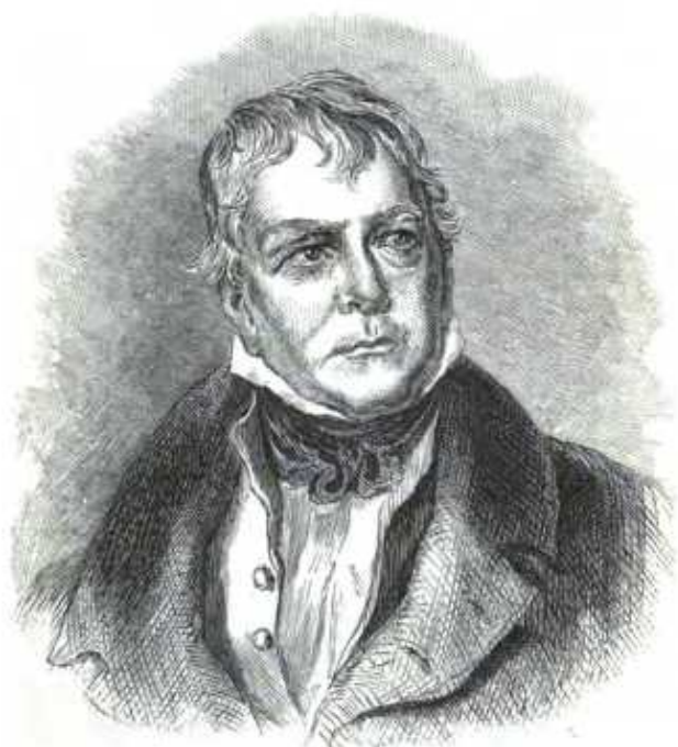
SIR WALTER SCOTT.