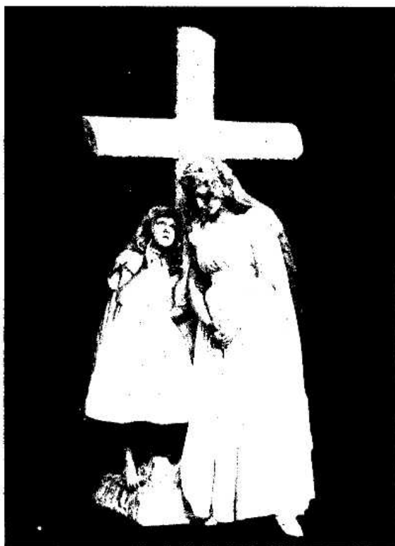
THE MORNING DAWNS. HUGUENOT DESCENDANTS DAUGHTERS OF THE AUTHOR.