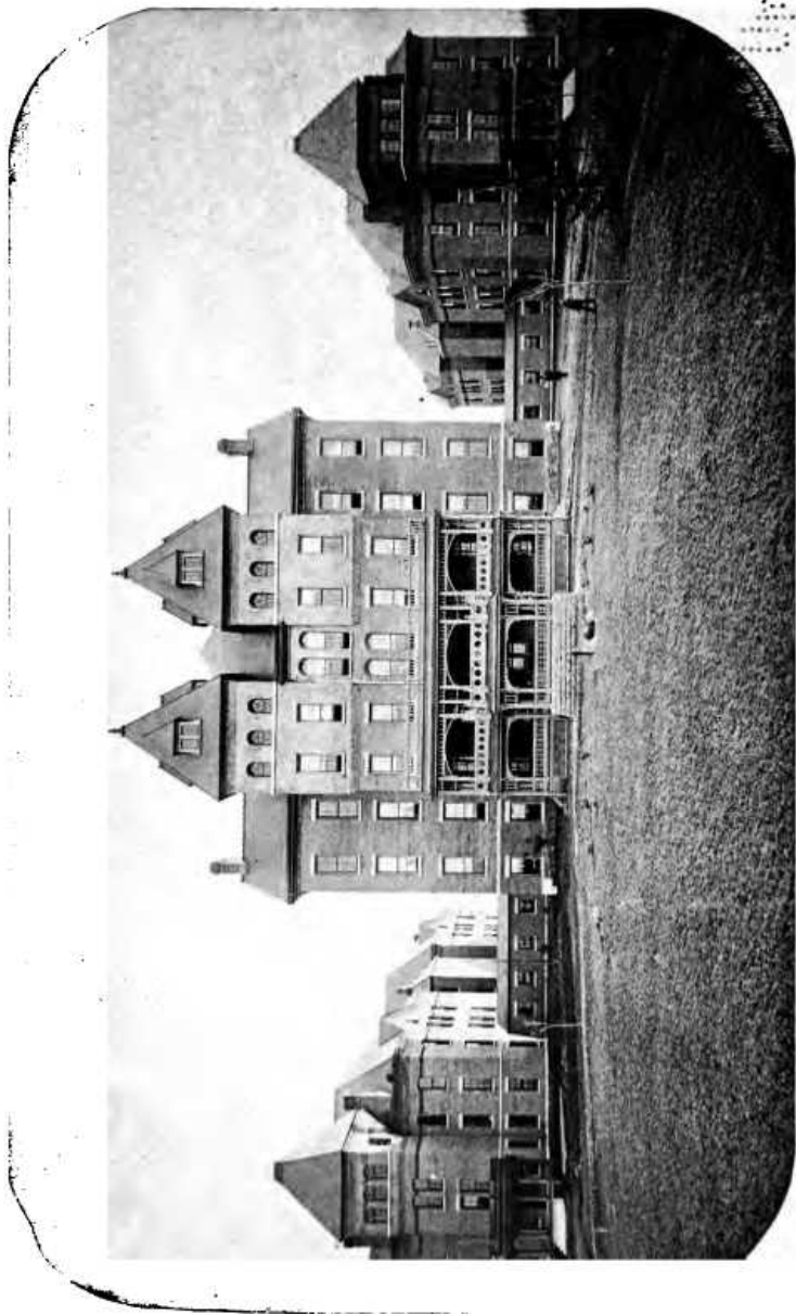
MAIN BUILDINGS OF THE NEW YORK STATE CUSTODIAL ASYLUM FOR FEEBLE MINDED WOMEN NEWARK, N. Y.