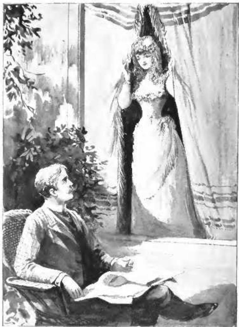
A LADY SOMEWHAT STRANGELY APPOINTED SERVED FORTH. FRONTISPIECE—Stevens, Vol. Fourteen.