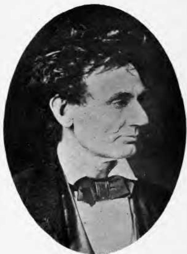
Lincoln in the Fifties.