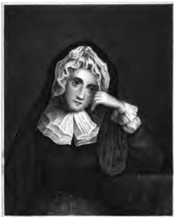
LADY RACHEL RUSSELL.