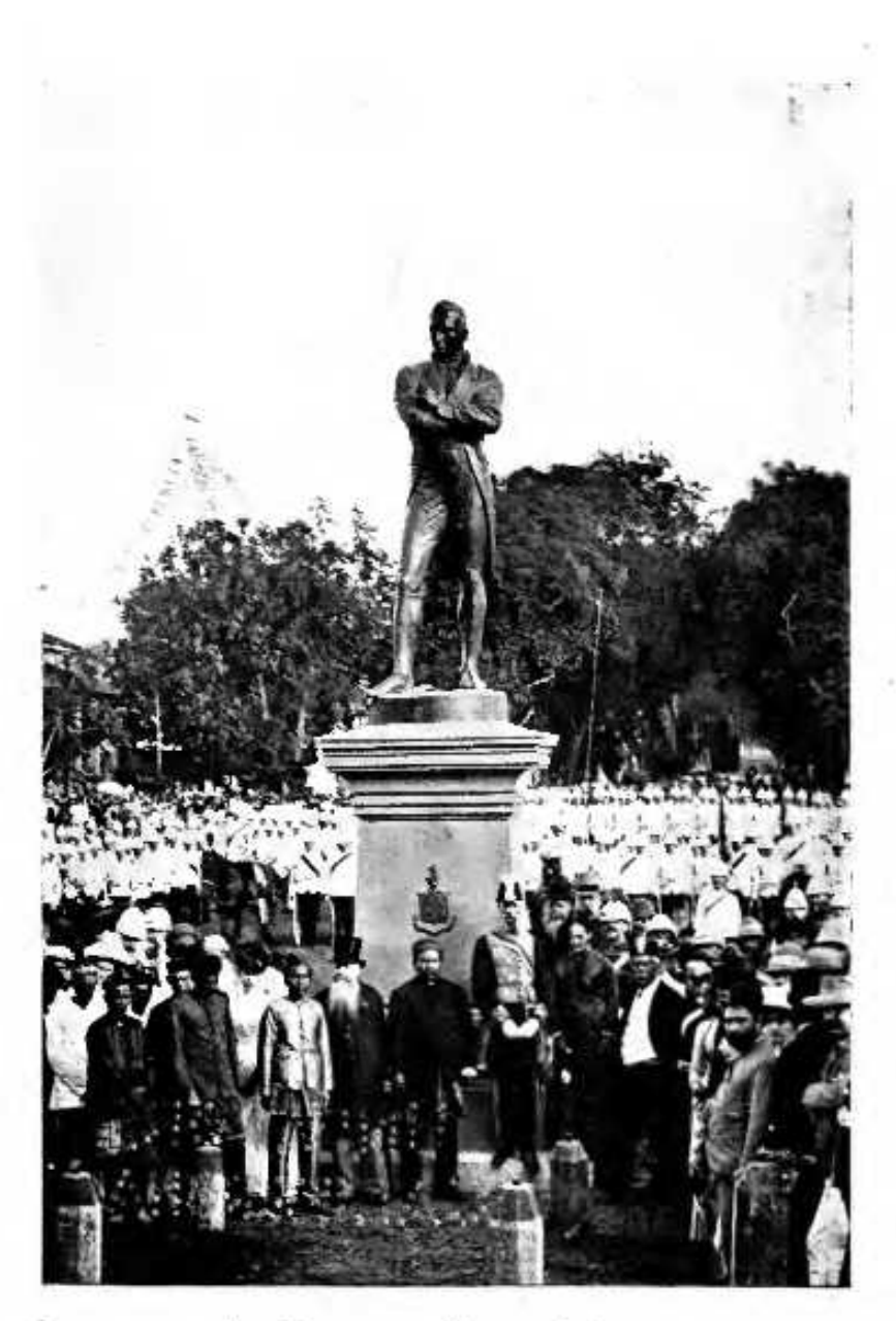
SIR STAMFORD RAFFLES' STATUE.