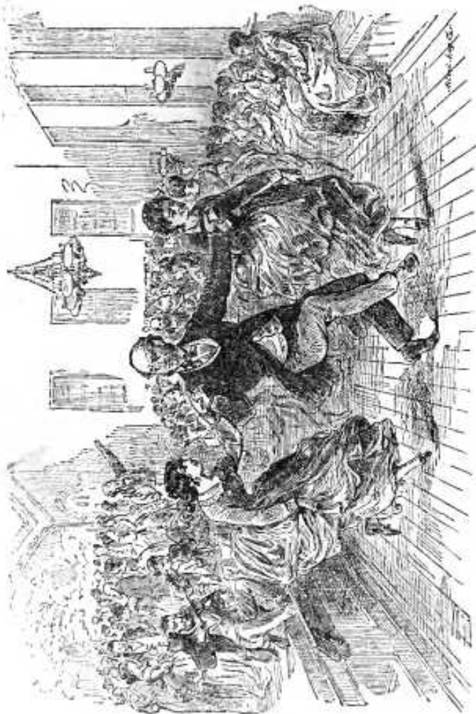
HIS NEW WIFE.—THE "WALLFLOWERS."—Page 89.