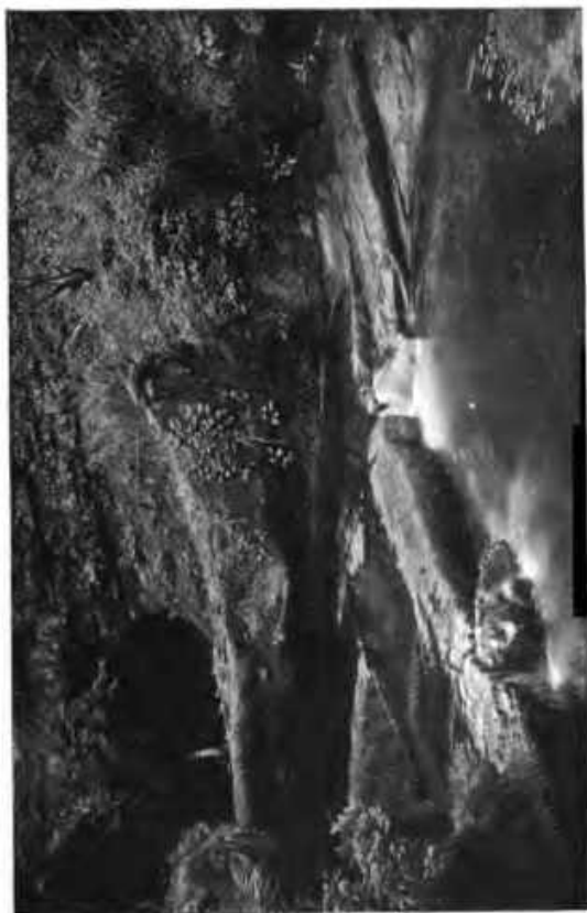
THE HOUR OF SWEATH, KIPPE . .