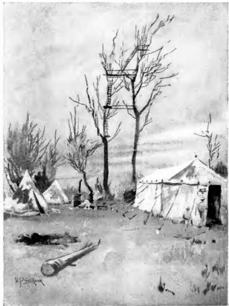
V.M.C.A. AND GERMAN OBSERVATION STATION IN THE TREES AT ACHIET-LE-PETIT