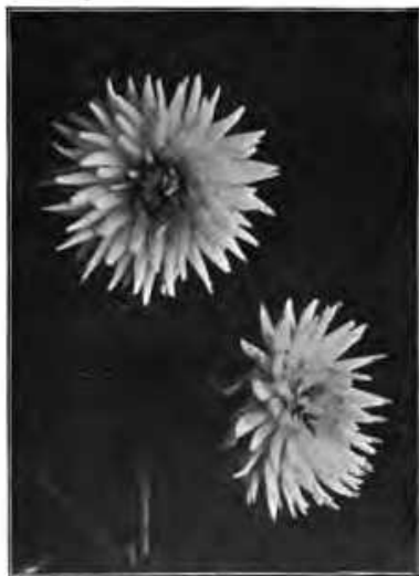
Cactus Dahlia "Greens White"