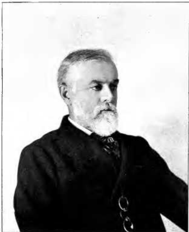
GENERAL ROY STONE

[Father of the good-roads movement in the United States]