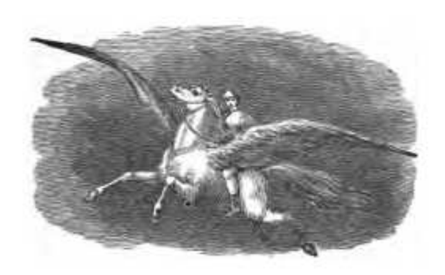
BOSTON HOUGHTON, MIFFLIN AND COMPANY New York: 11 East Seventeenth Street Che Mittergibe Press, Cambridge