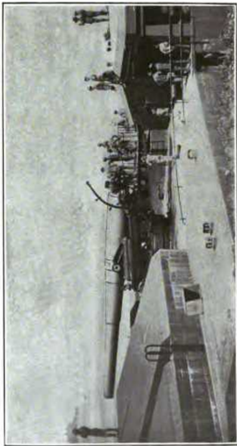
A 12-INCH GUN ON BARBETTE CARRIAGE. [Frontispiece.]