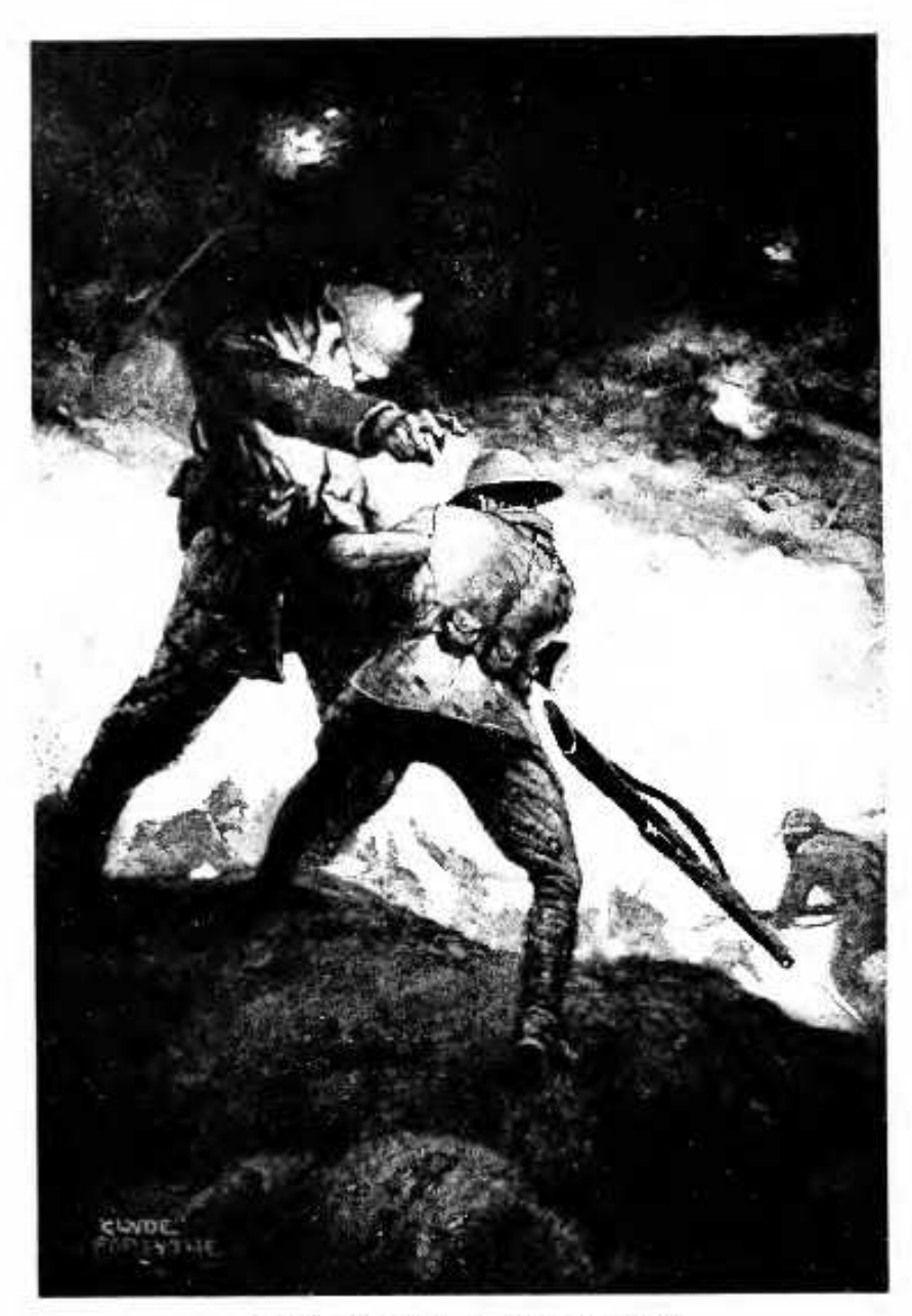
I had got him! I had got him!