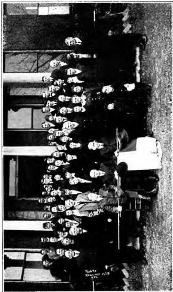
INTENSIVE TRAINING COURSE CLASS IN KANSAS CITY

Kansas City Seminary and Training School