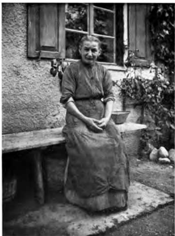
A German Mother, Who Has Given Her Seven Sons to the War. She and Her Three Grandchildren Were Trying to Live on Potatoes—all They Had.