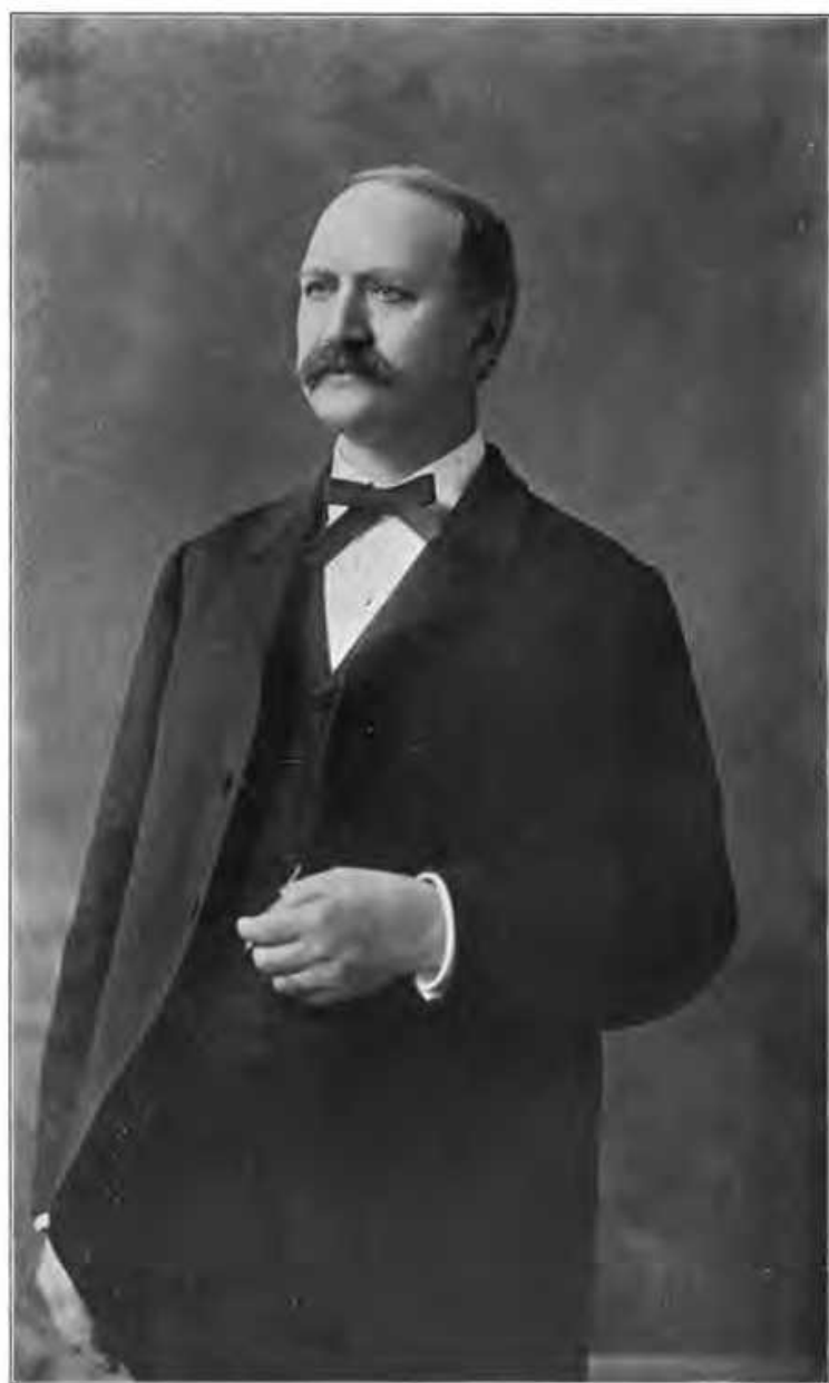
THE HONORABLE JOSHUA S. SALMON