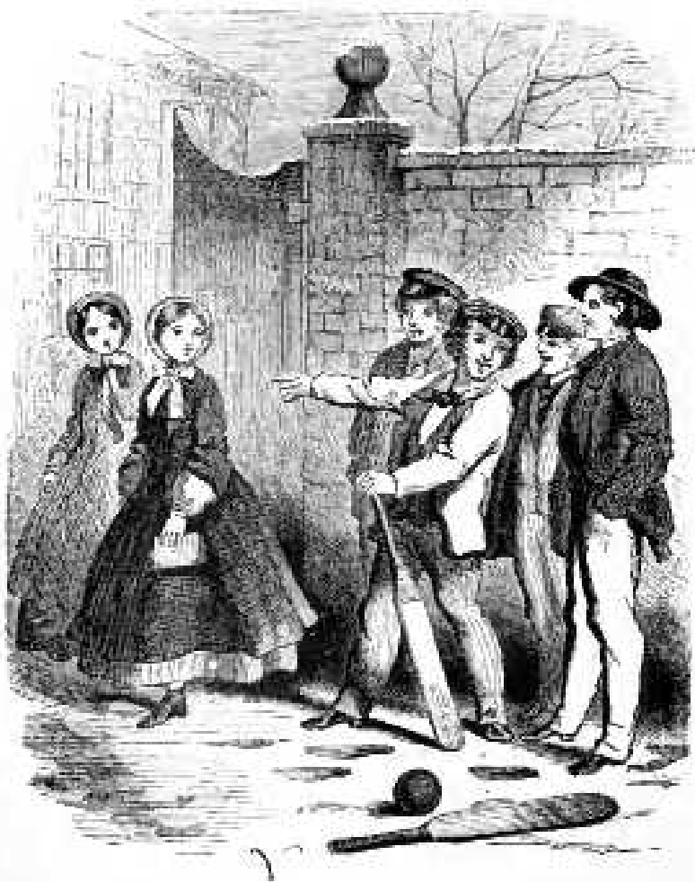
They overheard one of these boys remark sneeringly to the teacher, there go the Saints." p. 31.